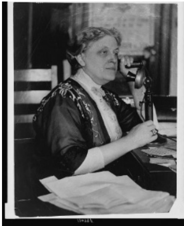
Carrie Chapman Catt Founder of the League of Women Voters

``a mighty political experiment''--``an anomaly, we will be a semi-political body--we want political things; we want legislation; we are going to educate for citizenship . . . we have got to be nonpartisan and all-partisan.''